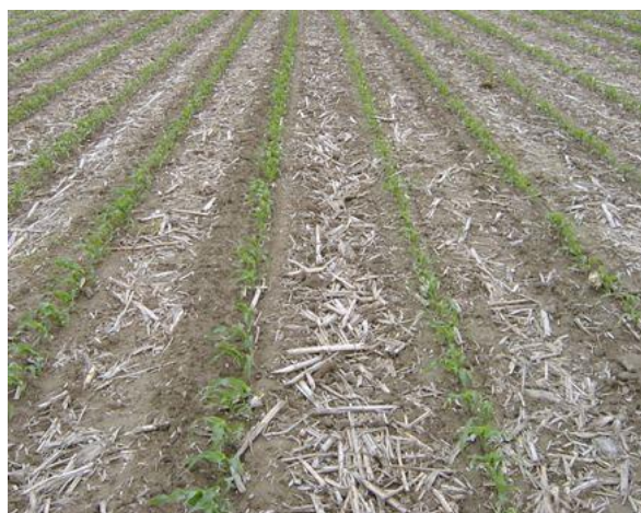
Second year strip-till maize

The uncultivated ground prevents wind and water erosion and maintains soil strength. Uncultivated soil is more able to support vehicles (reducing compaction damage) and provides better traction.