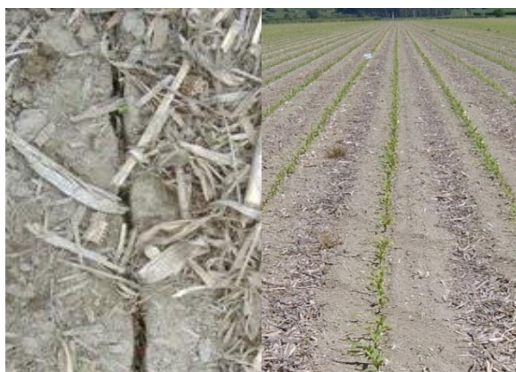
Seedlings in open slots are at risk of slug damage and poor emergence

Monitor for slugs and use slug bait if necessary.