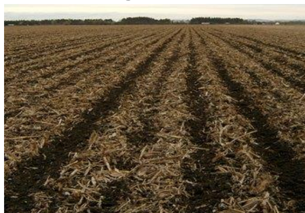
Residue managers clear cultivated strips and lay mulch in the inter-row

Strip tillage and other reduced cultivation systems generally retain more crop residues. There are three steps that prevent residue from becoming a problem