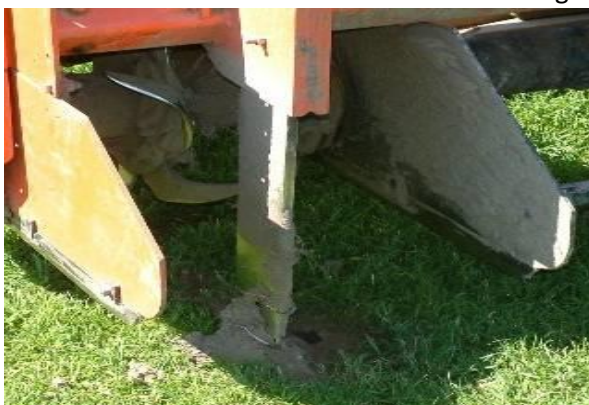
Modified rotary hoe strip-till machine with ripper leg

This rotary hoe uses a large tine with a wing to burst the soil along natural fracture lines. The wide wings increase the width of soil shattering and amount of soil lift achieved. The ripper has no break-out so care is needed to avoid damage.