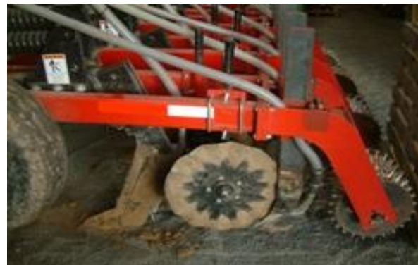
Deep strip-till machine capable of working to a depth of 0.5m – note fertiliser coulter behind working disk

One machine works at depths around 0.5m. It is similar in design to an aerator, with gathering discs and crumblers to help develop the tilled strip. This machine also has the ability to place fertiliser in the tilled strip.