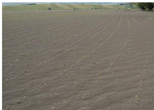
Wind erosion can cause crop losses

Soils of higher quality require fewer inputs to grow equivalent yields. Uncultivated ground has a greater load carrying ability. This can be especially important under moist conditions when crops have to be harvested to a factory schedule.