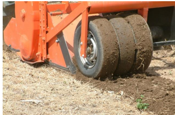
Triple tyre roller consolidating the rotary hoed strip

The rotary hoe itself is used as a secondary cultivation tool. A tyre roller at the back consolidates the soil.