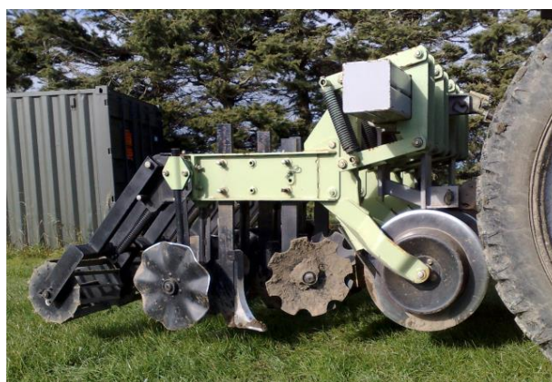
Orthman strip-till machine cultivates strips ~ 200 mm wide

The photo below shows an Orthman tine machine.