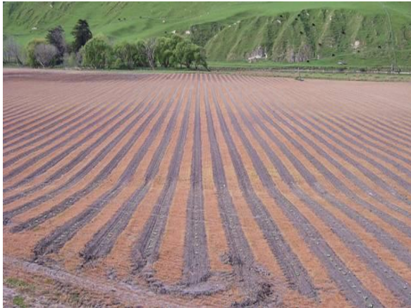
Sandy field strip tilled with a modified rotary hoe

Powered strip-till machines are usually modified rotary hoes or similar. Sections of blades are removed so that only strips are cultivated. Shields are installed to keep soil in the tilled zone.