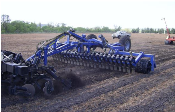
Cambridge rolling helps break any clods for better herbicide application

The gathering discs shown are scalloped. In some situations, the discs throw soil on to the inter-row. This may be reduced by reversing the discs so the concave side faces away from the knife. Some machines use a roller to press and crumble the soil. Others use a cage to rework the soil and some lay it in a raised berm.