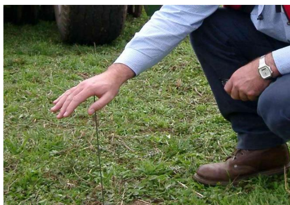
A welding rod makes a simple penetrometer: if you can't reasonably push it into soil with the palm of your hand, roots can't penetrate either