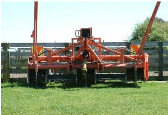
Modified rotary hoe strip-till machine cultivating three 500mm strips per pass

Powered strip-till machines are usually modified rotary hoes or similar. Sections of blades are removed so that only strips are cultivated. Shields are installed to keep soil in the tilled zone.