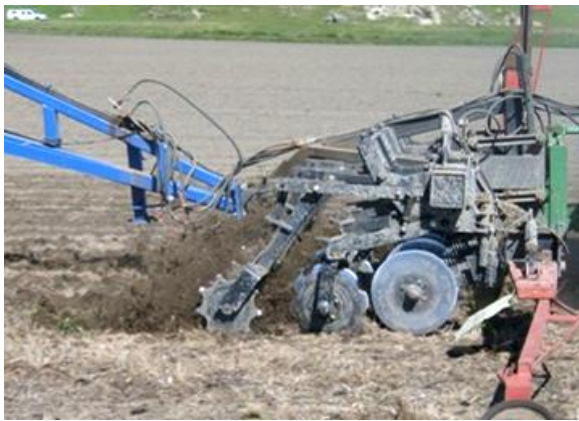
A mole-knife strip-till machine in action, note the additional soil working by the cage roller

The catching discs catch the soil thrown up by the knife, rework it, and lay it in a narrow strip. The roller at the back provides additional crumbling and consolidates the soil.