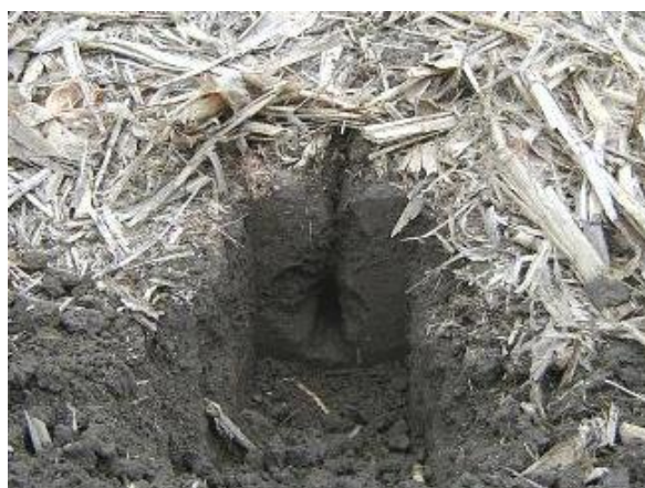
Mole-knife strip-tilling in wet conditions produces a mole drain effect instead of a seed bed

Wet soil will result in mole drains instead of seed bed development. If the soil is too dry it is also unlikely that good tilth will be created. The soil will be excessively hard and will not burst along the smaller fracture lines.