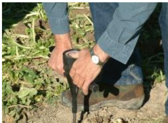
Hand-held soil penetrometer measures penetration resistance to give a guide to the degree of soil compaction

Penetrometers measure resistance to a probe being pushed through the soil and show depths and degree of compacted layers. Note that measurements are specific to soil moisture levels.