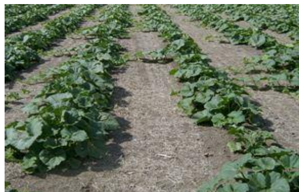
A clean start often follows through the life of the crop

Effective weed control is essential. In a strip-till system, conventional inter-row cultivation may be impractical. With a good clean start the weeds should remain manageable.