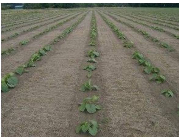
Strip-till squash with 30% soil cultivated

Intensive tillage reduces soil physical quality. Cultivating only 1/3 of the field should slow or stop the decrease in soil quality.