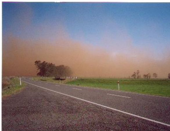
Wind erosion event in Central Hawke's Bay

Wind erosion is a particular problem on light and unstructured soils. It causes absolute soil and nutrient loss. Sand blasting damages crops and young crops can have to be replanted. This both increases expenses and reduces returns as potential yield will be reduced and supply contracts not met.