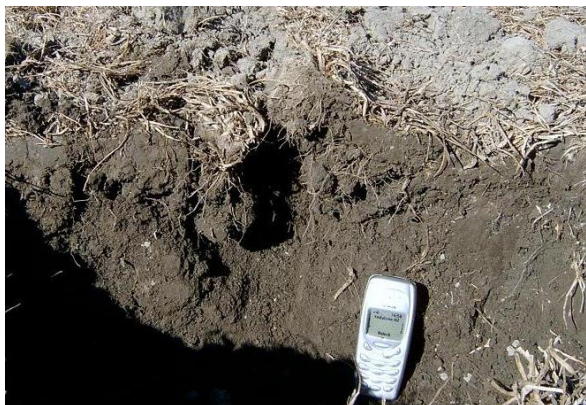
Fresh grass roots act like reinforcing mesh, preventing shattering and seed bed development

Fallow is particularly important when growing corn or maize in fields out of pasture. A longer fallow reduces pest pressure by starving the pests before planting. Seed treatment will also help in reducing pest damage.