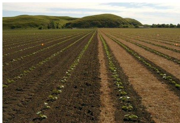
Paddock split in half for a strip-till trial

A total of 43 trial sites were set up on 22 farms. In each case a cropped paddock was split in half. One half of each paddock was strip-tilled while the other was cultivated conventionally. Both halves were planted on the same day with the same varieties. The crops were managed by the farmers according to their normal practice.