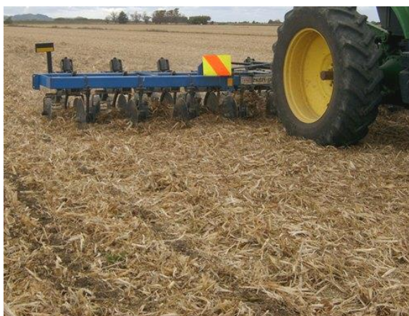
DMI strip-till machine in heavy maize residue - able to cultivate twelve ~200mm strips per pass

There are several different designs of tine strip-till machine operating in New Zealand. These strip-till machines rely on the tine to burst soil along natural fracture lines.