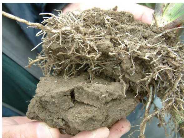
Platy soil structure and horizontal roots, both are sure signs of compaction

Winter grass should be established using no-till or min-till to retain as much soil strength as possible. Manage winter grazing of cropping soils carefully to avoid pugging damage. Keep stock off during wet conditions to minimise soil damage.