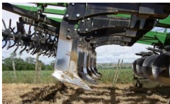
An aerator can be used after planting to remove compaction in inter-row areas

One farmer has been aerating after planting. His aim is to remove compaction after all field operations are complete, leaving the soil in good condition for root growth. It also leaves time for the soil to reconsolidate before harvest.