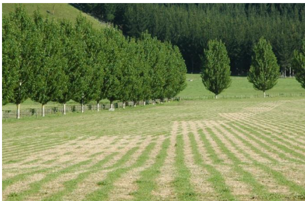
Strip sprayed pasture allows for root breakdown yet pasture and be grazed for a further 6 weeks

It is possible to spray out the strips to be tilled but continue grazing the rest of a pasture. Using a parallelogram arm system ensures the spray nozzle is at correct height regardless of contours. The whole paddock can be sprayed out after strip-tilling and planting, but before emergence.