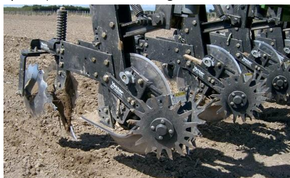
Parallelogram mounted knife with depth skids. Residue managers fitted at front avoid trash build-up

Some systems put residue managers (clearing system) ahead of the cutting disc coulter.