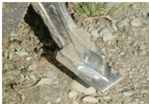
Close-up of a mole-knife wing-tip to increase soil working

better tilth and an optimum environment for young seedlings. Not all machines have a wing.