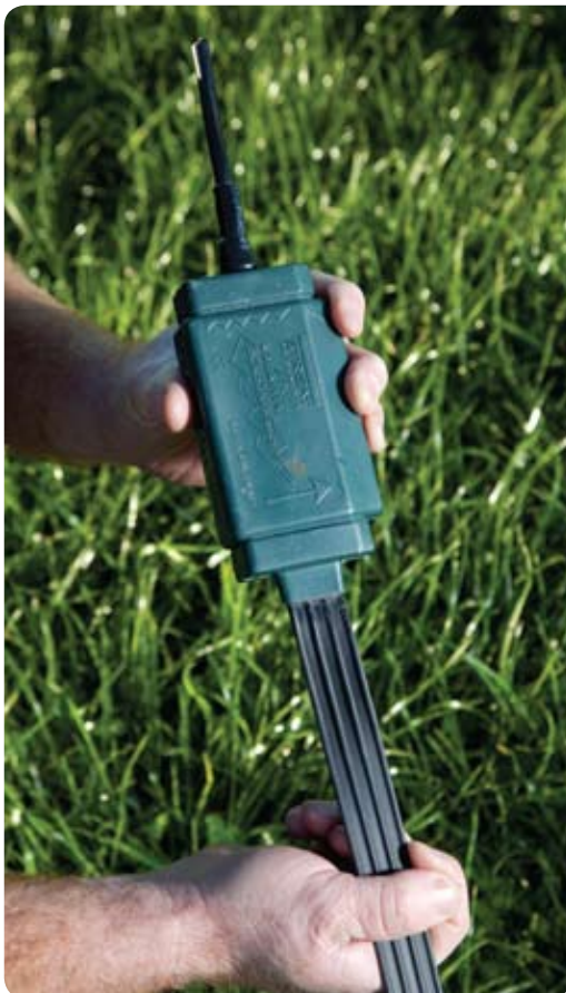
An Aquaflex sensing unit, which is buried underground.

Each measuring site cost $3,500 to install, and consists of two 3 m plastic sensors which are buried parallel to each other 50 mm and 500 mm below the surface