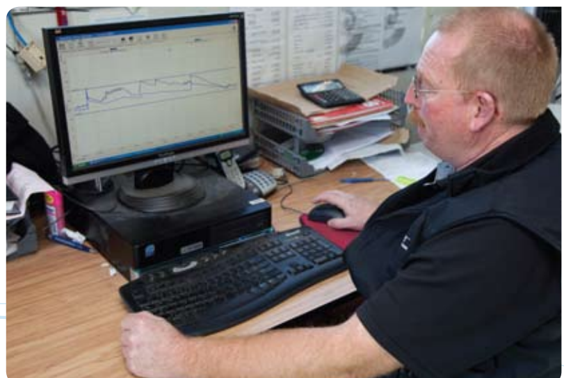
Viewing soil moisture readings, which are transmitted to the computer.

“As with any aspect of running a successful farm it’s important to take several different factors into consideration in order to make better management decisions.”